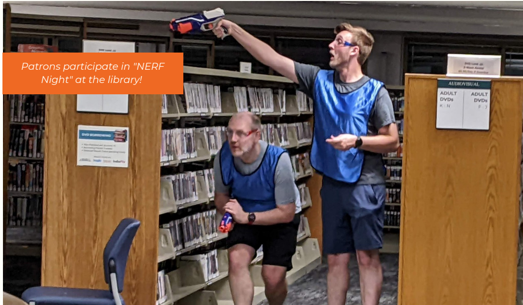
Patrons participate in "NERF Night" at the library!

West Des Moines Public Library Monthly Newsletter