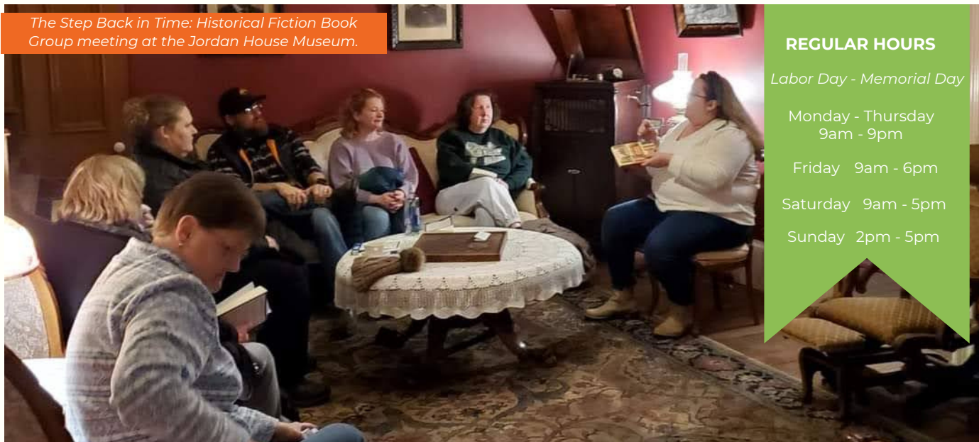
The Step Back in Time: Historical Fiction Book Group meeting at the Jordan House Museum.