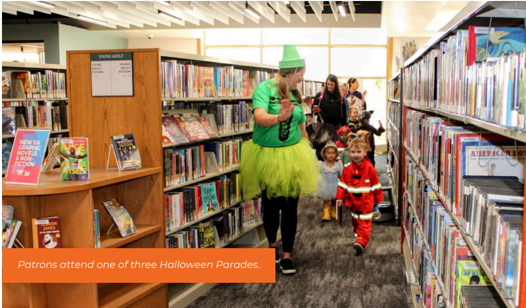
Patrons attend one of three Halloween Parades.