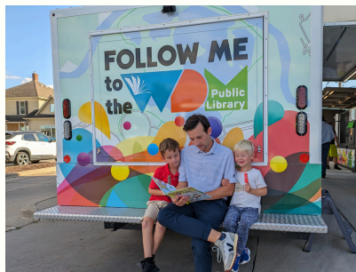
The WoW at our Ice Cream Party at the Valley Junction Kiosk.