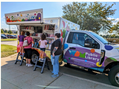
The WoW out at Illumifest 2024.

Want to know where the Words on Wheels is headed next? Check out our Outreach calendar at wdmlibrary.org/outreach