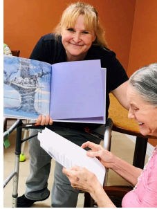
Senior Care Facility Outreach, February 2024