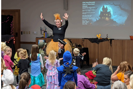
Halloween Storytime, October 2023