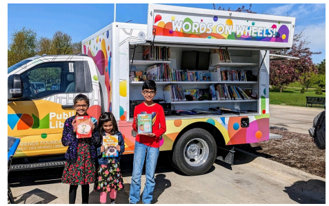
Young patrons check out books at the Words on Wheels, April 2024